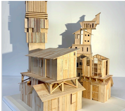
Jeremy K Bullis 43 South 3rd Street, Hudson

I combine painting and drawing resulting in work dense with visual information, reflective of the increase in our digital, social and political confusion.