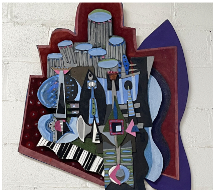
Reggie Madison Basilica Back Gallery, Hudson

These paintings are based on small graphite line drawings, which is a departure from the starting point of previous bodies of work derived from detailed dark/light collages.