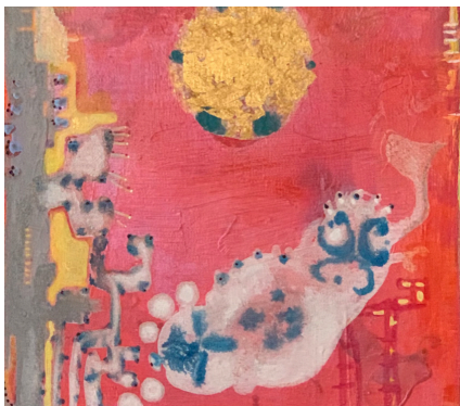
Peggy Cyphers 248 State Street, Hudson

The purpose of my painting is to express the magnificence of this amazingly beautiful universe. I celebrate the mystery of my sensory communication with plants and animals, water and earth.